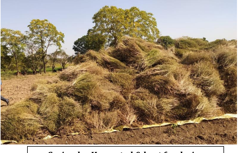
Coriander Harvested & kept for drying

Acreage has increased by about 40% and Harvesting in Gujerat is progress. Crop already in is estimated to be around 175,00,000 bags – 700,000 tons. Result is that prices that had peaked at 120/kg are now down to levels of 70/kg and I am sure if we have hit the bottom yet or not (Though I think it's almost there now) -Unfortunately, not a happy situation for the Farmers, but this is the reality of today. Buying should be considered at these levels now, at least for the next 3 /4 month's needs. The downside is really very limited now.