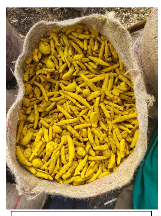
New Arrivals of Turmeric

Crop is looking good, but in some areas, we are seeing Rhizome Rot and Leave curling also probably due to excessive and prolonged rains in this Belt. There is no reason to panic because most of the other areas are still looking normal. Farmers are already now starting to Harvest their crops in certain Belts like Nizamabad. Arrivals in Nizamabad now are around 15-18,000 bags /day (70 kgs/bag) and arrivals will continue to increase gradually. Availability will of course again be plentiful and prices will remain. Range bound within the 10/15% price band only. Farmers are now starting to complain that at these prices it's a loss for them to grow Turmeric, so I suspect that there will be a resistance from farmers to sell if prices drop any lower. My view is that prices are cheap enough now, so there is no reason to wait but one should start buying now and keep averaging it out through the season.