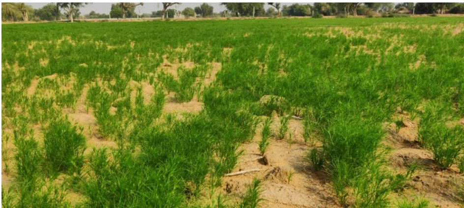
NEW CROP UNDER FLOWERING

Let's keep our Fingers crossed and bless the plants, so they grow well, and pray for favorable. Weather in the coming Months, if good weather continues, we might even see some improvement in yields but this is very premature optimism. Prices have already improved about 20% from the earlier lows, and holding stable for now. Long term outlook is definitely Bullish.